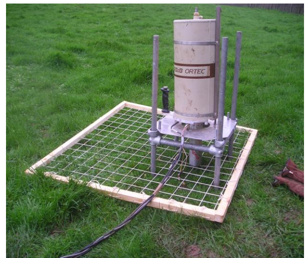
Figure 1. Using an in-situ gamma spectrometer to measure areal activity.

The most common method for accurately measuring low-level radioactivity is by gamma spectrometry. This is a relatively simple procedure that involves minimal sample preparation and is non-destructive, which allows repeat measurements to be undertaken on individual samples. Field-based areal activity measurements can be performed in-situ using a field gamma spectrometer, shown in Figure 1. Although no sample preparation is required, the crucial factor for obtaining reliable results is to ensure that the radiometric protocol adopted at the beginning of an investigation remains consistent throughout the monitoring campaign ( cf. He et al., 2002; Greenwood et al., 2008).