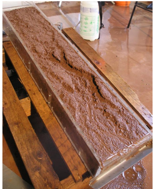
Figure 6. A partially developed rill-system.

The particle size composition of each pair of samples from each soil was determined and the grain-size was measured at corresponding 10 percentile intervals and statistically tested to determine whether the size-difference was significant. The results indicate that rill-eroded sediment was significantly coarser than inter-rill eroded material for the majority of soils investigated.