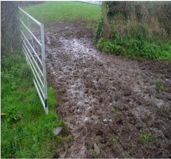
Figure 4. An example of a heavily poached gateway.

those findings, numerous studies seeking to identify potential sediment-sources (Brazier et al., 2007; Bilotta et al., 2008) have singled-out the effect of poaching by livestock (Warren et al., 1986a, 1986b; Pietola et al., 2005; Haygarth et al., 2006; Bilotta et al., 2007, 2008). Poaching occurs where livestock congregate, such as on the banks of watercourses, around feed-troughs and in gate-entrances (Figure 4). This increases the susceptibility of the soil to erosion, particularly by rainsplash and surface runoff, due to its degraded structure (Kauffman and Krueger, 1984; Warren et al., 1986b).