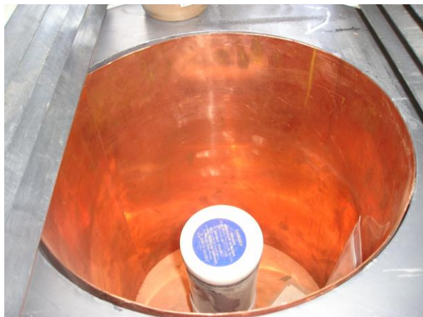
Figure 2. The interior of a static gamma spectrometer. The weighed sediment sample is placed, in a container, on the detector-head (fitted with a white end-cap).

radiometric assays should always be performed in containers of identical dimensions so that the sample-geometry, and hence the distance from the radioactive source to the detector-head, remain constant.