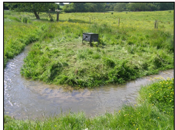
Figure 3: Tracking equipment in situ at the field site used by the author. The MPD and two 12V batteries were housed in the black box and antennae were buried under the substrate of the river.

problems of multiple tags being recorded at the same time or interference between antennae positioned close together. Each antennae cost approximately £175 (2009 price) and the MPD cost £1450 (2009 price). Over the tracking period, we successfully recorded over 10,000 point locations of a total of 65 PIT-tagged crayfish. Therefore, we obtained a continuous record of every time a PIT-tagged crayfish was present in a predefined habitat unit over the 150 day study.